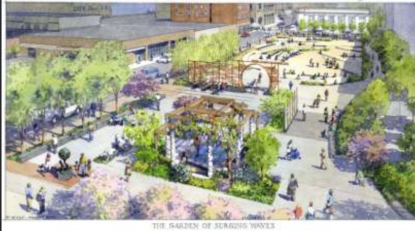
THE GARDEN OF SURGING WAVES